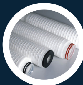
Filters & Cartridges