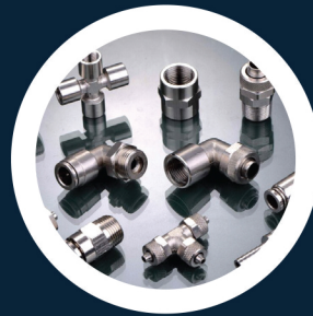
Plumbing & Fluid Control Pipes & Fittings