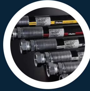
Pneumatics, Hydraulics & Hoses