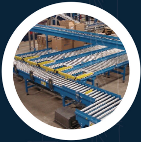
Conveyers & Conveying Devices