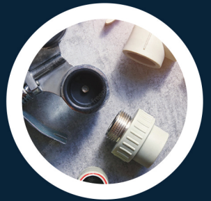
Couplings & Accessories