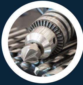
Power Tools & Accessories