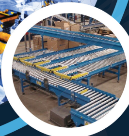
Conveyers & Conveying Devices