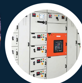
Electric control panel